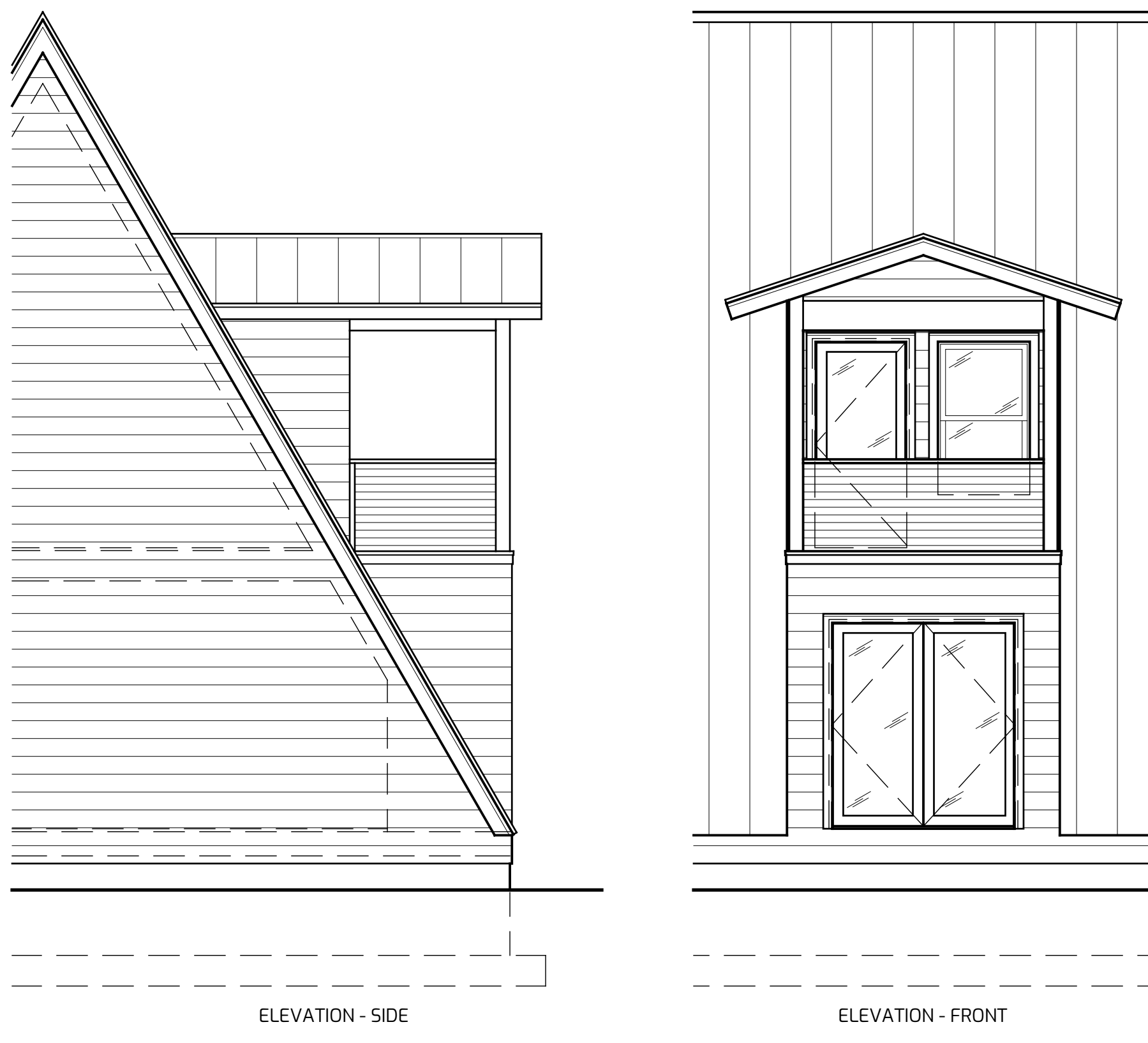
UPPER LEVEL COVERED DECK ABOVE MAIN LEVEL DORMER