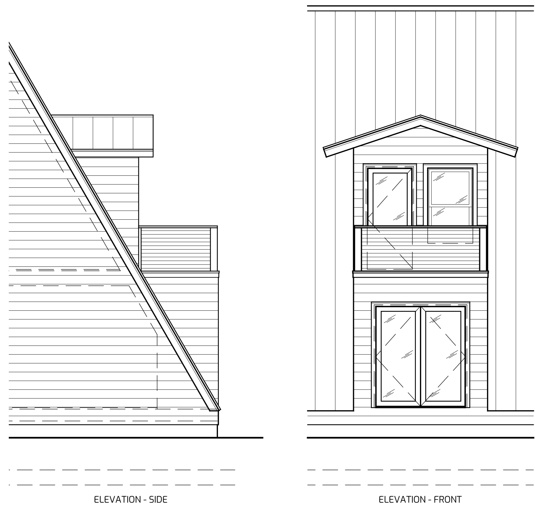
UPPER LEVEL DECK ABOVE MAIN LEVEL DORMER