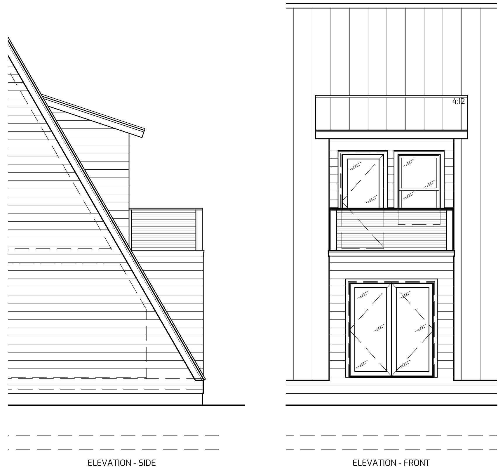
UPPER LEVEL DECK ABOVE MAIN LEVEL DORMER